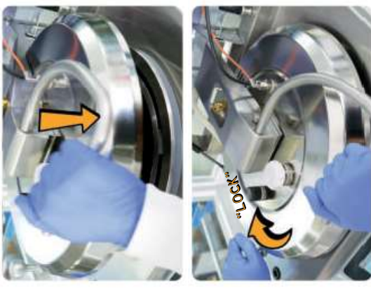
Safety lock with 12 hooks !