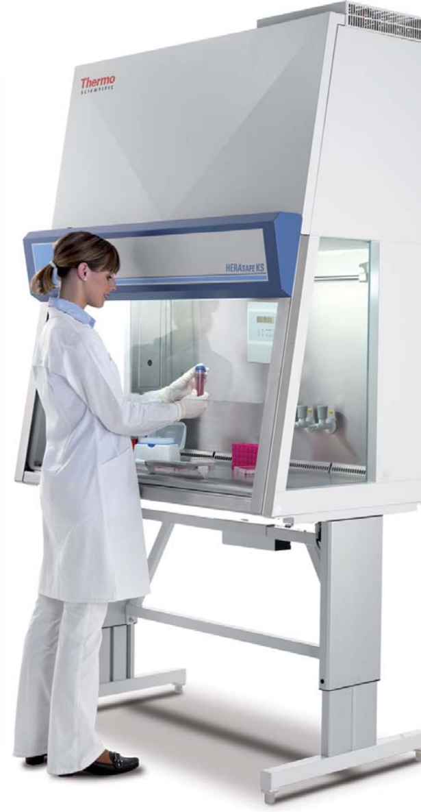
Thermo Scientific Herasafe KS biological safety cabinet