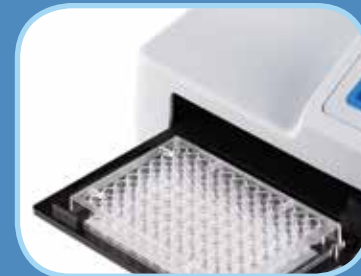
Robot-friendly plate carrier for both 96- and 384-well plates