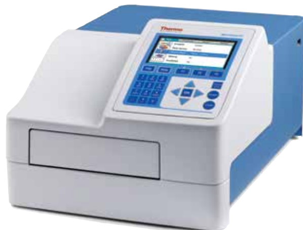
Multiskan FC microplate photometer

The large color screen of the Multiskan FC, combined with the simple and logical internal software, ensures easy and intuitive assay setup. The 'quick keys' allow instant access to the most commonly used protocols in routine laboratories. In addition, the internal software contains both qualitative and quantitative calculations for single, dual and kinetic measurements providing flexible data handling capabilities.