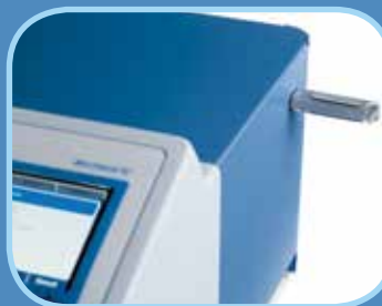
USB port for easy data transfer

Applications: Immunoassays (ELISA), protein assays, endotoxins, cytotoxicity and proliferation assays, enzyme assays and growth curves